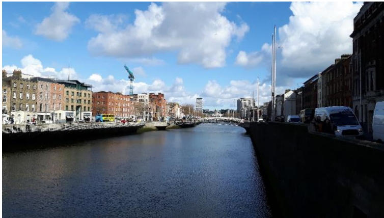
Some other photos you might wish to use.