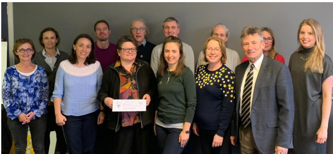
Pictured above are members of the project team at the recent meeting in TU Dublin.

For more information please contact XXXXXXXX